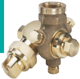
Type 4629-3/4-TOC Single Swivel with 3/4" NPT (F) pipe connection. Brass.

W = Maximum effective coverage with nozzle mounted at 36" height.