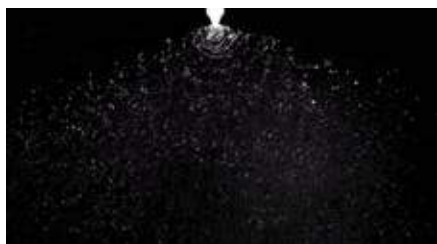
140° wide, large droplet spray pattern for industry leading coverage of liquid fertilizers.