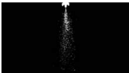
Straight through design squeezes fluid flow to create the spray pattern versus deflecting fluid flow and creating un-needed spray drift.