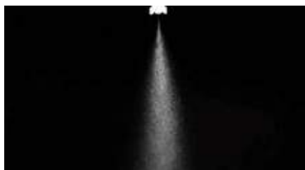
Polyacetal construction provides a wear resistant orifice to ensure pattern integrity.